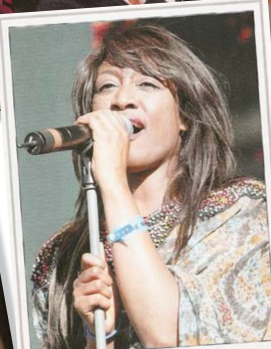
Beverly Knight performed at the party