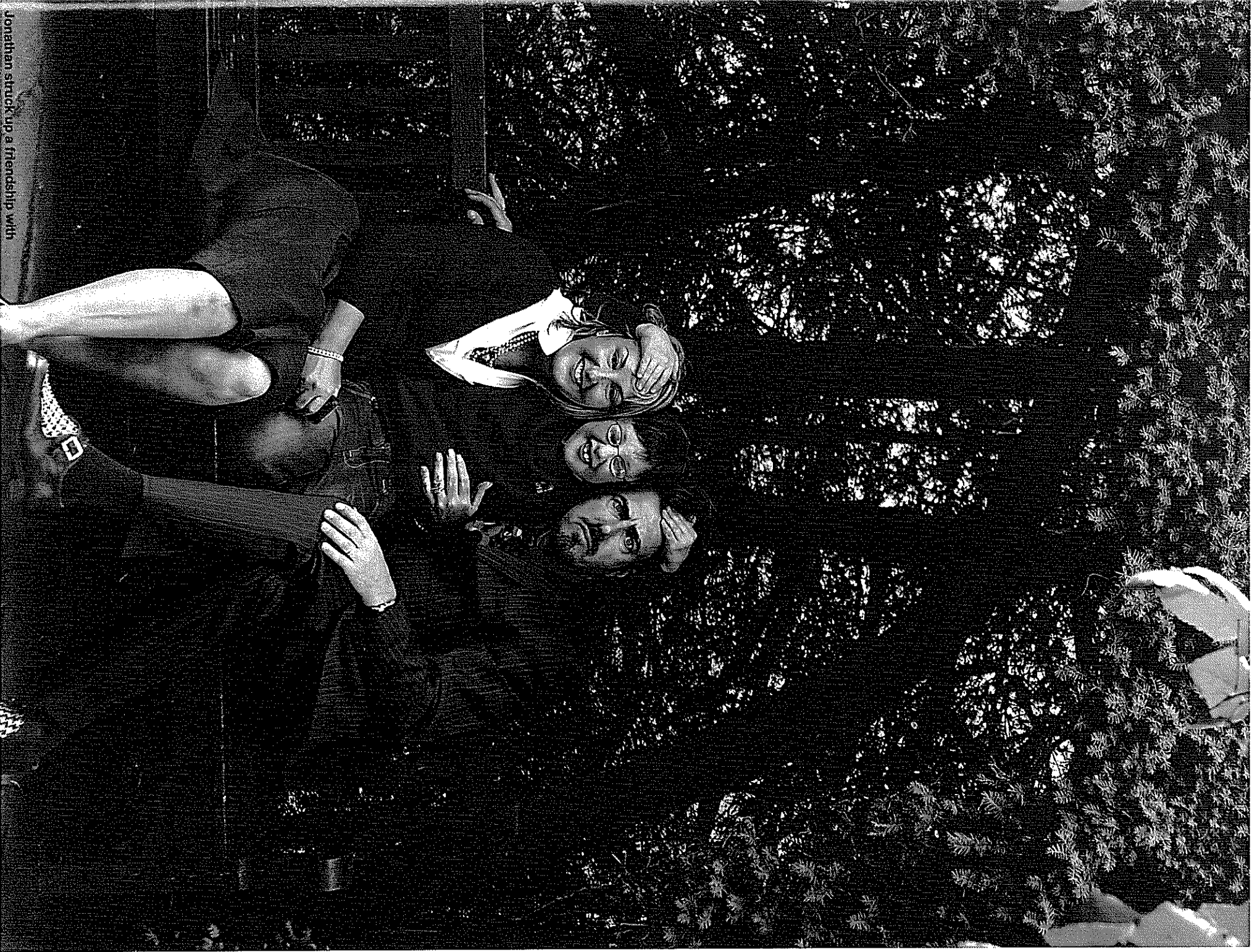
Jonathan struck up a friendship with